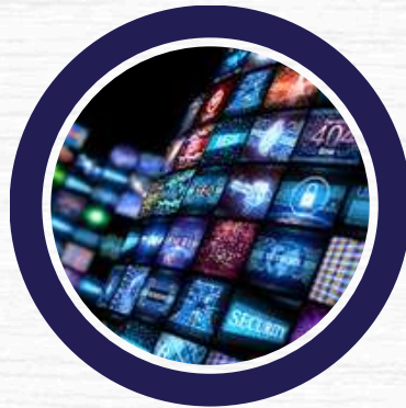
MEDIA PUBLICATION HOUSE