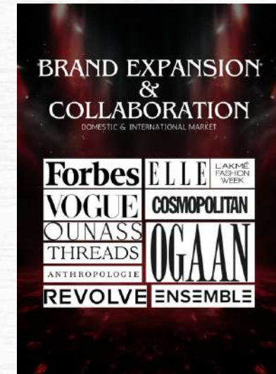
BRAND EXPANSION & COLLABORATION