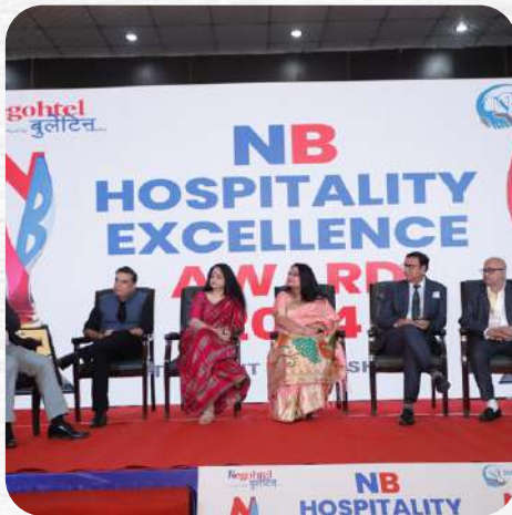
NB HOSPITALITY EXCELLENCE AWARDS 2024