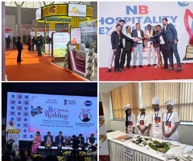
EVENTS & EXHIBITIONS