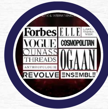
BUSINESS EXPANSION & COLLABORATION