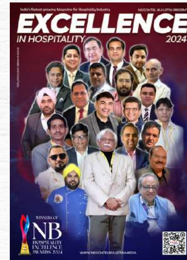
MEDIA PUBLICATION HOUSE