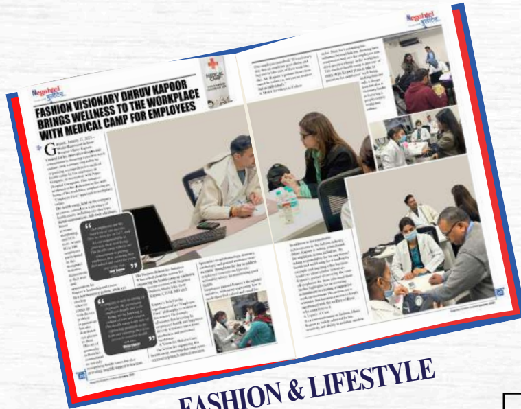
FASHION & LIFESTYLE